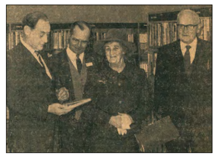
Market Rasen Mail, March 1971 (7)