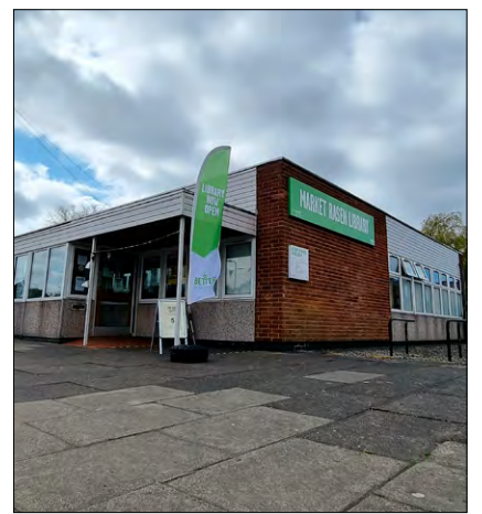
The current Market Rasen Library at Mill Road (2)